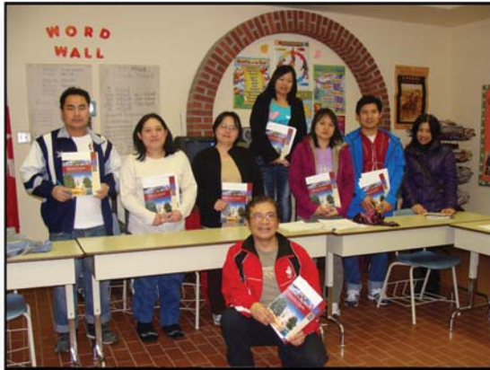
Citizenship Preparation Class

The program is designed primarily for recent newcomers. However, all immigrants, refugees, and their families requiring assistance are encouraged to access the services.